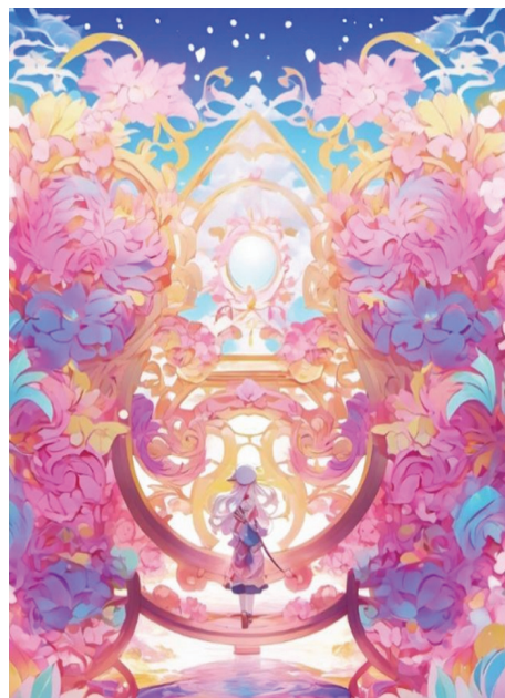
Fig.5 AI painting of Fuyang paper cutting

3.2.3 Expanding the application field to enrich the expression of paper cutting art. In addition to the traditional decoration and collection functions, Fuyang paper cutting can also be expanded to a wider range of application. Paper cutting elements can be applied in different design fields, which can not only enhance the cultural connotation and artistic value of design works, but also let more people understand and love Fuyang paper cutting art. For example, paper cutting elements can be incorporated into the packaging design of gift boxes, wine bottles, and food. The hollow effect and pattern beauty of paper cutting are used to enhance the visual appeal of products. In addition, it should cooperate with other art forms such