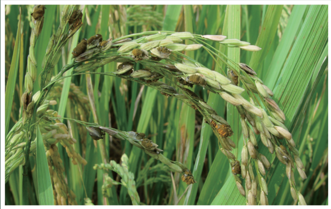
PLANT DISEASES AND PESTS

WU CHU (USA-CHINA) SCIENCE AND CULTURE MEDIA CORPORATION